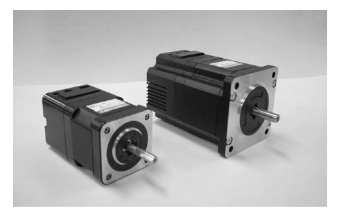
Figure 1 Exterior view of stepping motor with drive function (left 42 mm sq.) (right 60 mm sq.)

The driver is sealed in a case cover to prevent damage from outside objects and to protect the internal electronic parts. In addition, a switch and a five-figure, seven-segment LED are installed on the front face of the cover to make it easy to determine the condition and settings of the driver at a glance.